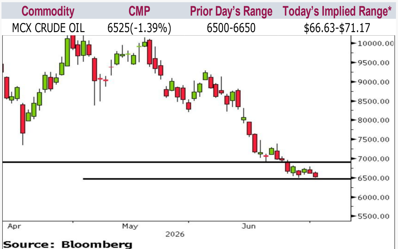
Implied range is for the Nymex front-month futures